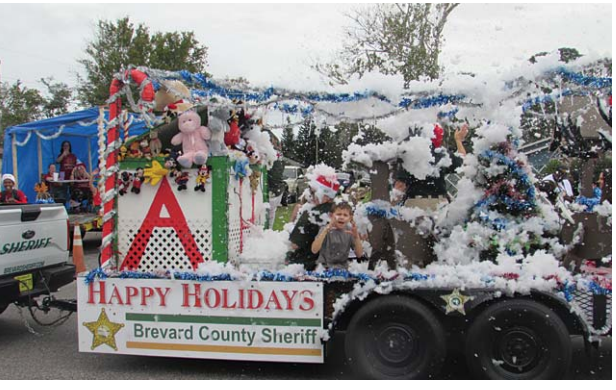
Brevard County Sheriff's Office